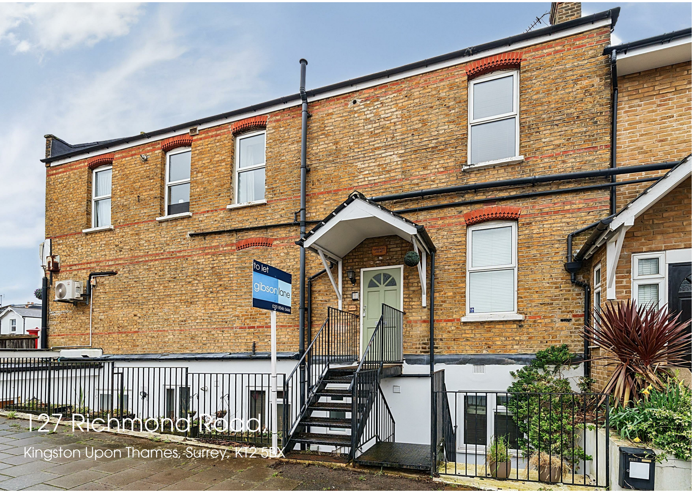
127 Richmond Road, Kingston Upon Thames, Surrey, KT2 5BX